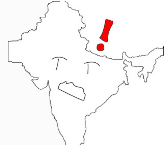
Weekly Newsletter of The Assam Valley Express