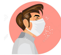
FACE- Do not touch