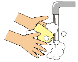
HANDS- Wash them often