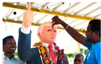
Statue of Donald Trump