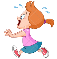
Don't PANIC, be AWARE