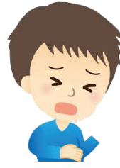
ELBOW- Cough into it