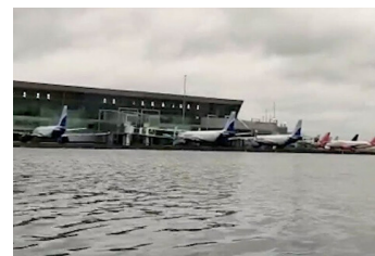
Kolkata airport after cyclon Amphan