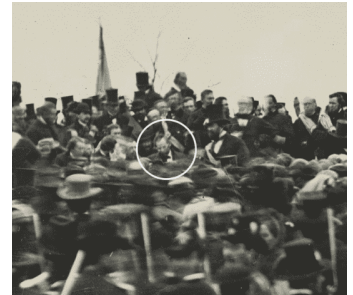
Lincoln giving the Gettysburg Address