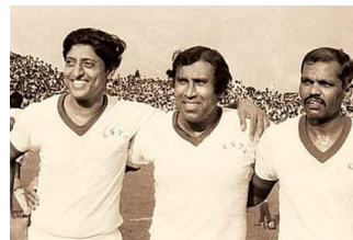
Indian football legends Chuni Goswami, PK Banerjee and Tulsidas Baram