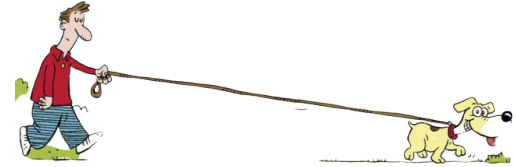
Maintain social distancing