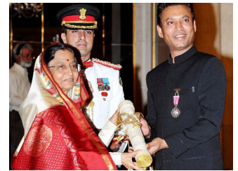
Irrfan was awarded the Padma Shri by then-President Pratibha Devi Singh Patil