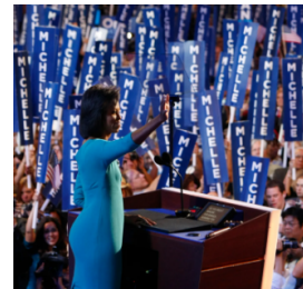
Michelle Obama delivering a speech to the Democratic National Convention