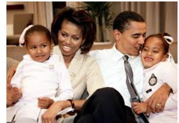
The Obama family