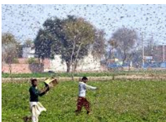
A plague of locusts