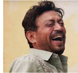
"People like to see my work, not my face!"