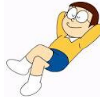
Take proper SLEEP