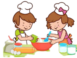
LEARN something new