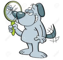
Be PROUD of yourself