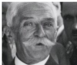
Pierre de Coubertin (Founder)