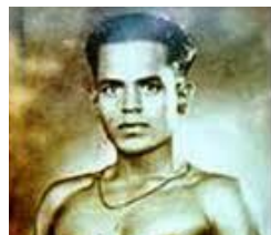
KD Jadhav, first Indian to win an individual Olympic medal