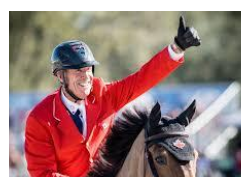
Ian Millar, most Olympic appearances