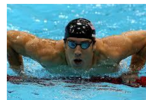
Michael Phelps (most Olympic medals)