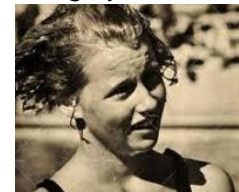
Marjorie Gestring, youngest individual gold medalist