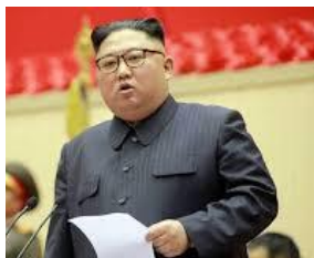
Kim Jong-un, Supreme Leader of North Korea