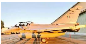
A Rafale Jet