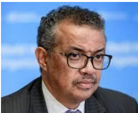
Director-General of the WHO, Dr. Tedros