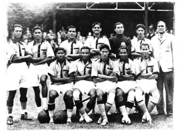
Dr. T. Ao captaining the Indian Football team during the 1948 London Olympics