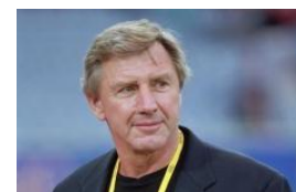
Al Oerter, 4 consecutive gold medals in Discus throw