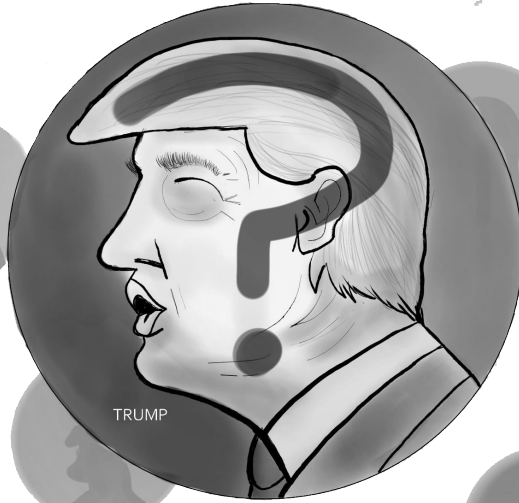
Illustration: Eloziini Senachena

India stands poised as it fends off attacks on three sides- the ceaseless onslaught of the Covid19, the spiraling economy and the unpredictable neighbour, China. As China's One Belt One Road faces road blocks, India's BRO is set to create history with Project Himank building the link road with Eastern Ladak over glaciers. U.S President Donald Trump has been nominated for a Nobel Peace Prize following his role in Israel-Middle East Negotiations, ironic to some and justified to others. Wildfires rages in Oregon, killing people and forest while speculation over the SSR case keeps TRPs high over lost moralities.