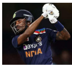
Hardik Pandya in retro 1992 World Cup jersey