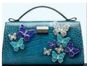
World's most expensive bag