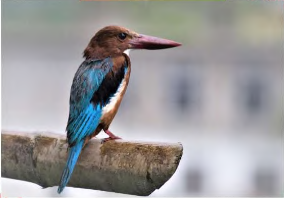
Photographer: Shrey Modi, Class 10 Place: Nagaon, Assam. Canon EOS 1200D (f/7.1, 1/400 & ISO 800)