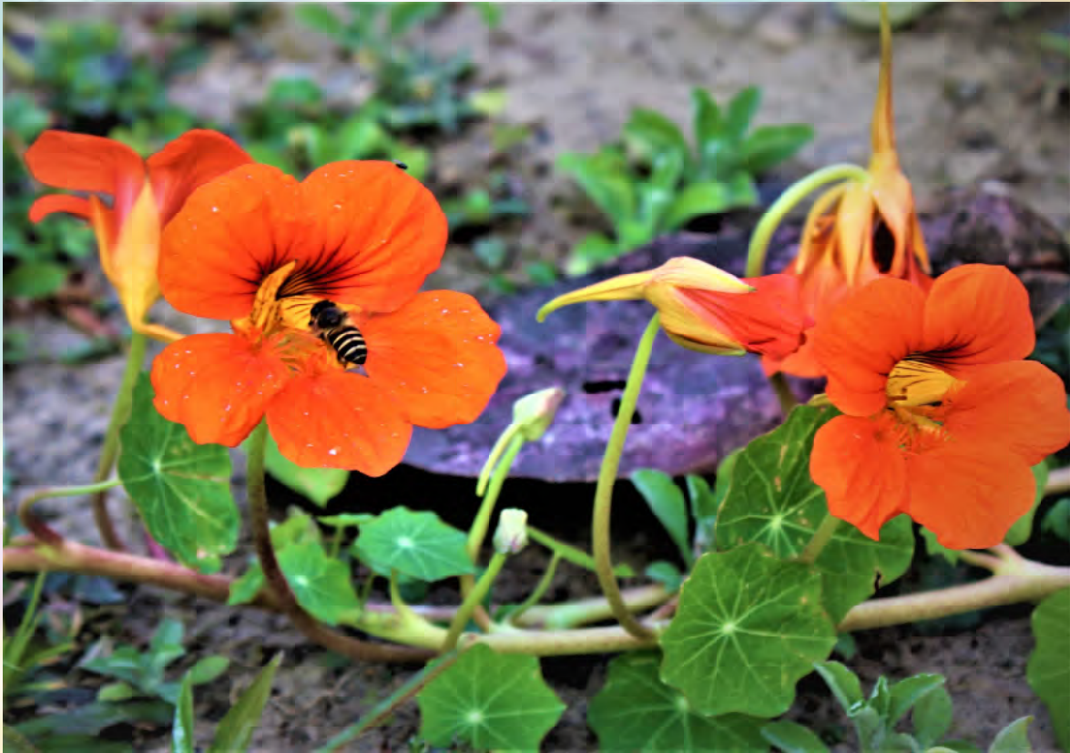
Ayushi Das, Class 10 Place: Balipara, Assam Canon EOS 15500 D (f/7.1, 1/80 Sec. & ISO 200)