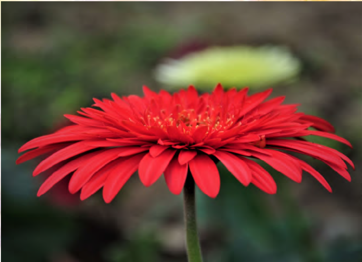
Kavish Agarwal, Class 9 Place: Balipara, Assam Nikon D90 (f/5.6, 1/100 Sec. & ISO 200)