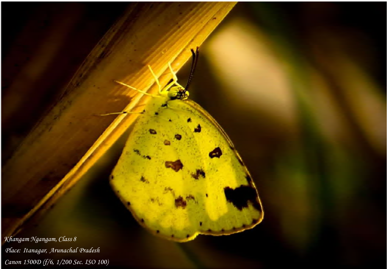
Khangam Ngangam, Class 8