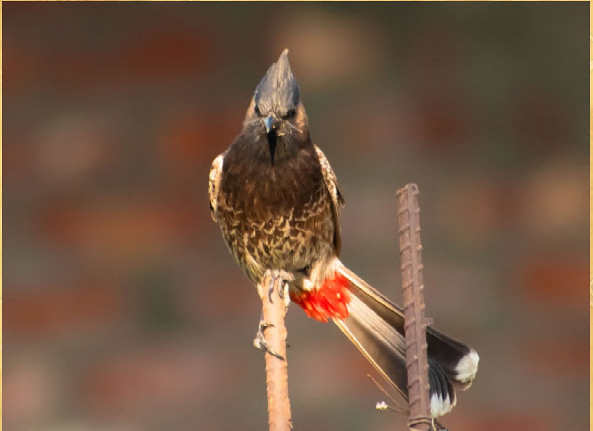
Deep Kanoi, Class 12 Place: Nagaon, Assam Nikon D3400 (f/6.3, 1/60 Sec. & ISO 200)