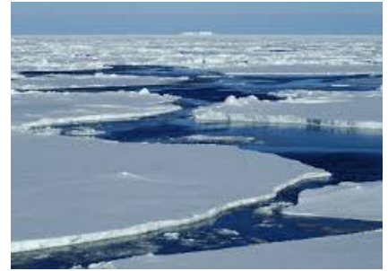
Polar Ice Caps are melting