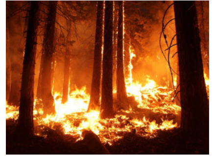
The Australian Forest Fires