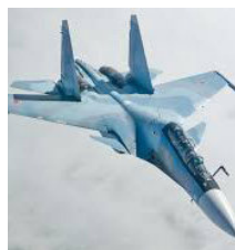
A Sukhoi fighter jet