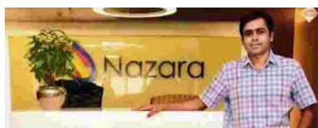
Rakesh Jhunjhunwala @ Nazara