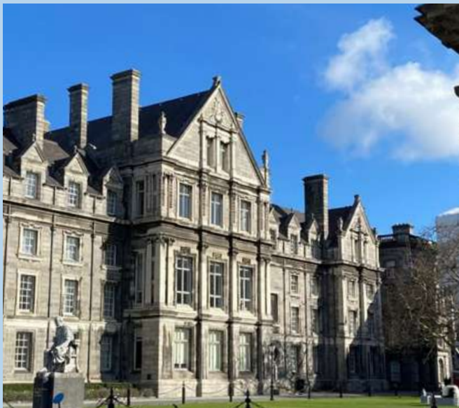
Trinity College, Dublin.

Ireland is known for being welcoming and inclusive. Indian students often find a friendly and multicultural environment that makes them feel at home. The country offers a high-quality education system, diverse cultural experiences, and ample opportunities for post-study work, making it a favorable choice for Indian students seeking international education and career prospects.