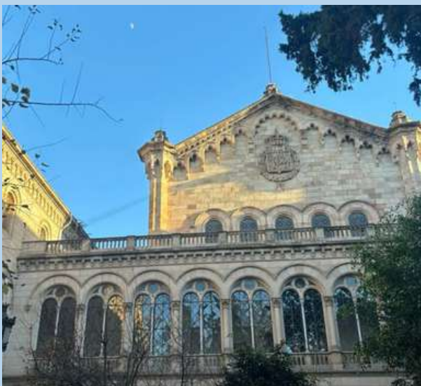
Universitat de Barcelona

Studying in Spain offers numerous benefits for Indian students, making it an attractive destination for higher education. Here are some compelling reasons: